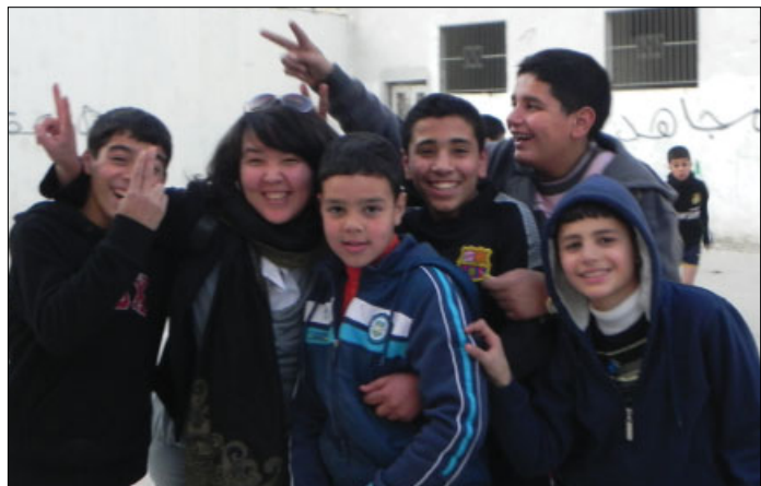
AT THE AL AMARI REFUGEE CAMP IN PALESTINE.

Having been fascinated with the Middle East for as long as I can remember, participating in a Group Study Exchange to that region was truly a dream come true for me. For one month, our team of young professionals was given a unique opportunity to visit five countries so different from our own and to study that part of the world on an