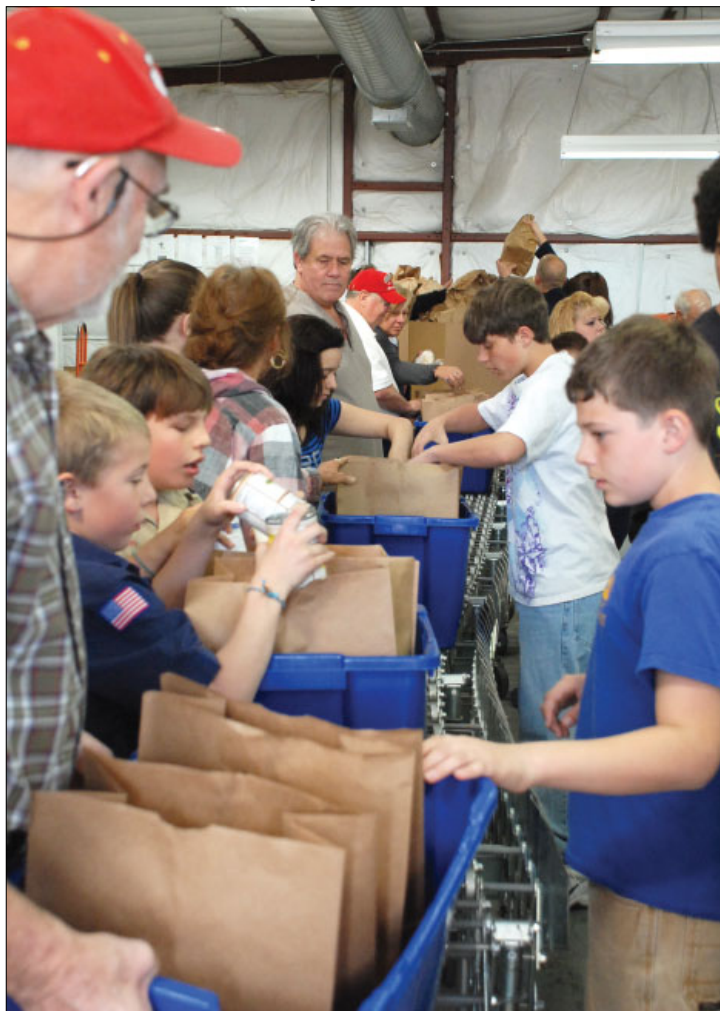
The Marana Rotary Club, Cub Scout Pack 261 and the Interact Club at Tortilita Middle School volunteer to pack food bags at the Marana Community Food Bank on Saturday, Feb. 4. The volunteers were able to pack 902 bags, a food bank record.