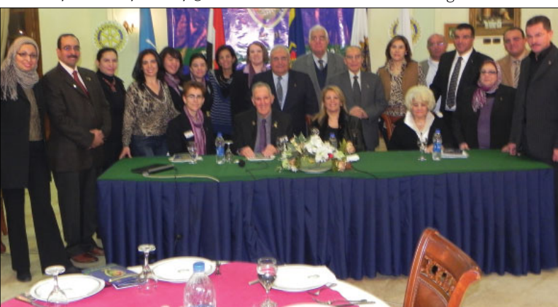
THE GSE TEAM AT ITS FIRST ROTARY MEETING IN EGYPT.