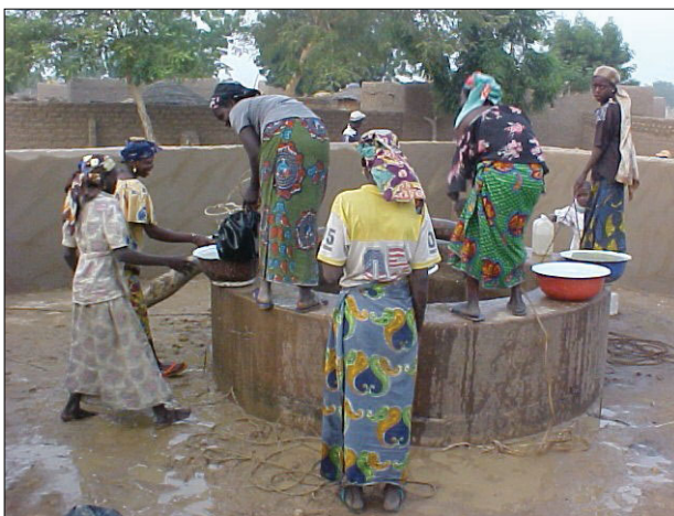
This photo is of the Dan Takobo well and is just one of the example of the many international projected clubs have participated in.

The new grants structure in its simpler form will look like this: