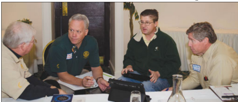
ROTARY LEADERSHIP INSTITUTE PHOTOS FROM © BLAINE E. MOYER